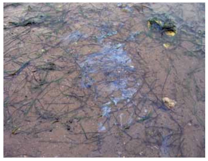
▲ Figure 16:Natural sheen produced by rotting seagrass.