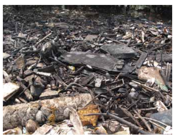
➤ Figure 26: Oil stranding on a coastline covered in debris can be difficult to quantify as the oil may be hidden from view.