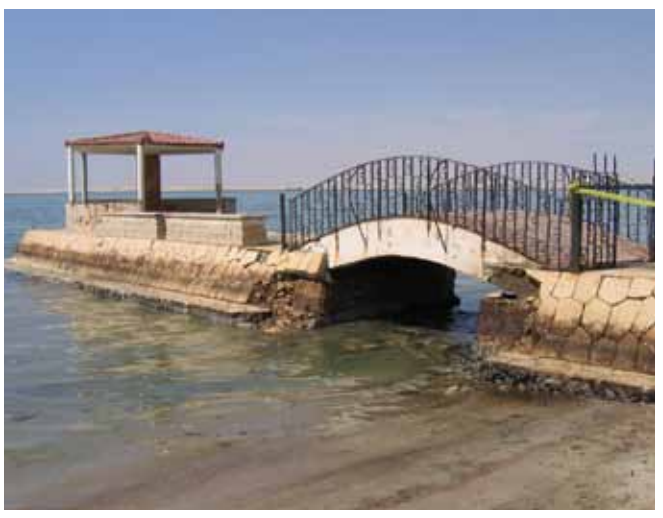
▲ Figure 14: Light oil staining of a stone jetty. This may be easily confused with algae growth.