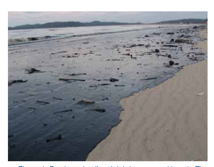
➤ Figure 1: Fresh crude oil and debris on a sand beach. The oil is typically black and of low to medium viscosity.

Other refined petroleum products shipped in bulk, for example petrol or kerosene, are relatively volatile and are unlikely to persist when spilt because of their rapid spreading and high evaporation rates. Lubricating oils used in vessel engines are relatively non-volatile and are an exception. Such oils may resemble car engine oil and have a tendency to form discrete lenses or discs when deposited on sand. Other oils can take the same form when spilt ( Figure 7 ).