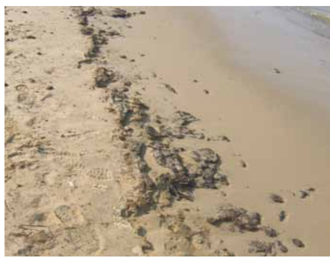
▲ Figure 6: Weathered oil on a sand beach.