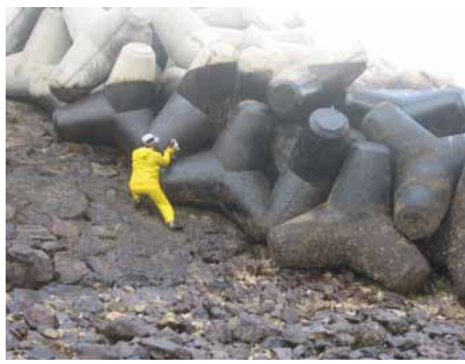
▲ Figure 29: Oil may become trapped between sea defences, such as these tetrapods, concealing the true amount that has arrived on shore.