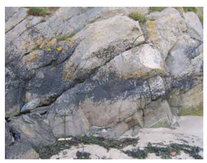
▲ Figure 17: Lichen on a rocky shoreline.