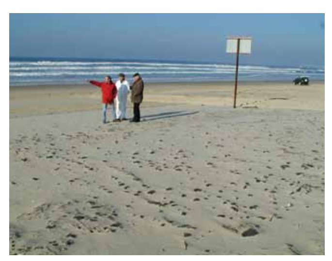
Figure 9: Tarballs scattered on a sand beach.