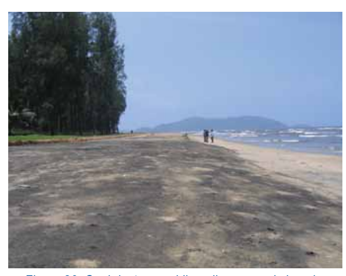
▲ Figure 20: Coal dust resembling oil on a sandy beach.