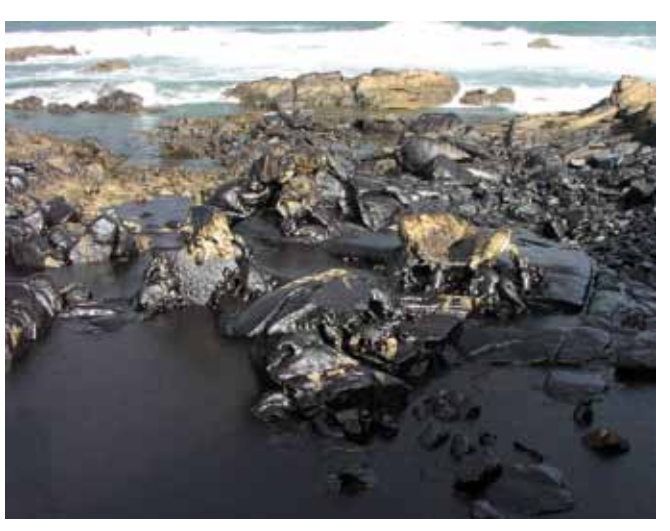
▲ Figure 3: Fresh fuel oil, in this instance relatively fluid and black in colour.