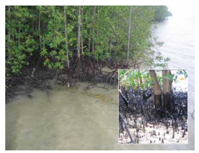
➤ Figure 23: Dark, wet mangrove roots may be confused with oiled mangrove roots (inset).

A rough assessment of the quantity of oil present across a stretch of coastline is needed for the purposes of initiating a shoreline clean-up operation and monitoring its progress. The distribution of oil along a shoreline can vary significantly and the task of estimating the quantity of stranded oil can lead to errors unless it is approached with care and consistency. The assessment is largely a visual one and will be more difficult or impossible if the oil is hidden from view, for example by layers of sand brought on-shore by subsequent tides ( Figure 12 ) or a covering of snow ( Figure 25 ). Oil stranded on debris or seaweed laden shores ( Figures 26 and 27 ), in mangroves ( Figure 28 ) or on other types of vegetation ( Figure 2 ), on rocky shores ( Figure 4 ), on sea defences ( Figure 29 ) or under jetties or quays will also be difficult to accurately quantify without further investigation.