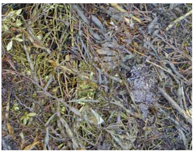
▲ Figure 27: Oil stranding on a coastline covered in seaweed can be similarly difficult to quantify.