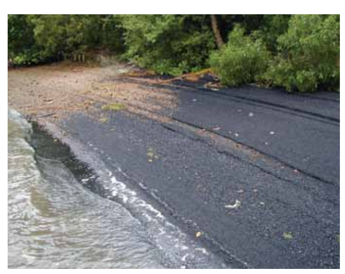
▲ Figure 19: Black vegetable matter.