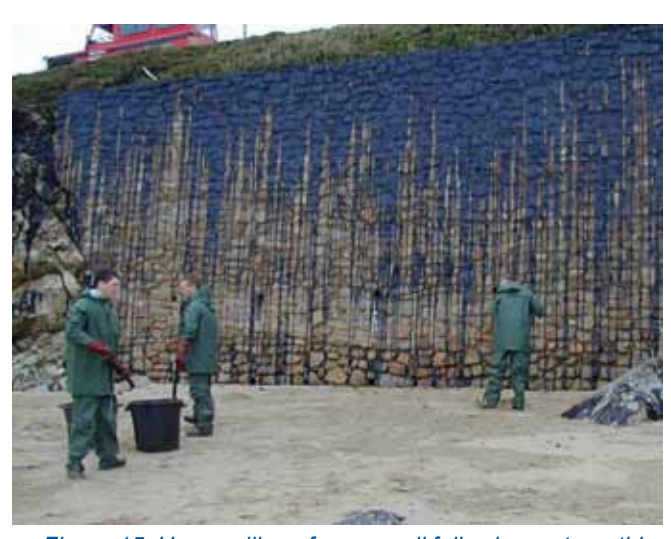
▲ Figure 15: Heavy oiling of a sea wall following a storm tide.

removal from shorelines are usually abrasion and natural dispersion as mineral- or clay-oil-flocculates, accelerated by elevated temperatures and exposure to wave action. In the longer term, the rate of weathering processes such as biodegradation and oxidation determines the persistence of stranded oil.