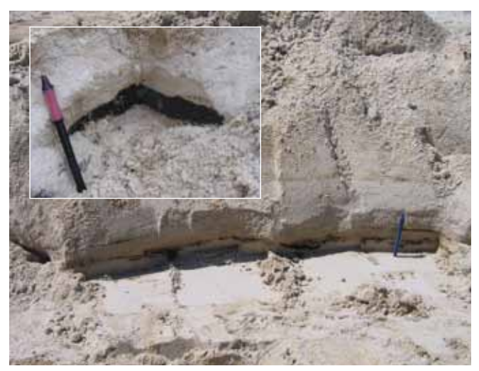
Figure 12: Layers of oil buried between clean sand by wave action.