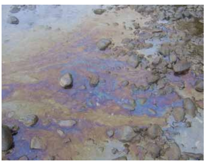
▲ Figure 11: Sheen emanating from a pebble beach.

colour (Figure 8). Examples of non-mineral oils are palm oil, rapeseed oil and olive oil.