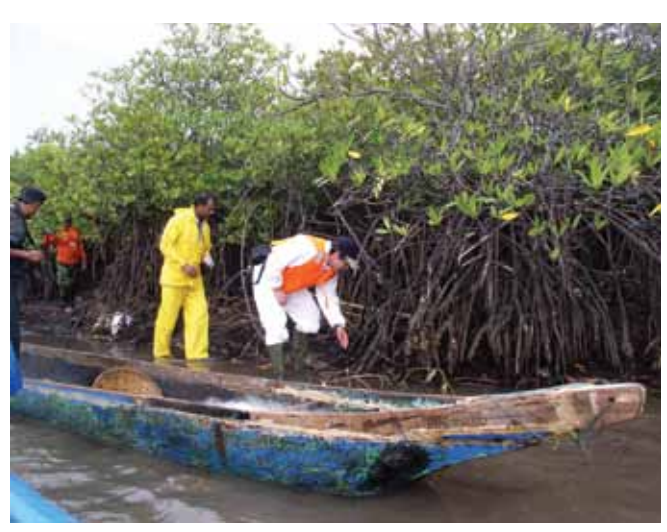
▲ Figure 28: Oil can get caught up in the complex root system of mangrove forests.