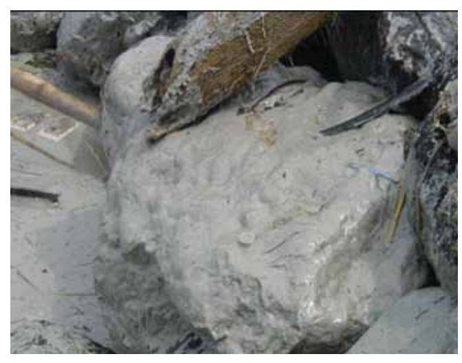
Figure 8: Grey water-in-oil emulsion of palm oil on a rocky shoreline.