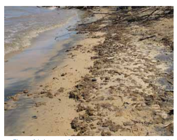
▲ Figure 21: Layers of black sand and yellow sand give the impression of contamination of the shoreline by weathered oil (compare with Figure 6).