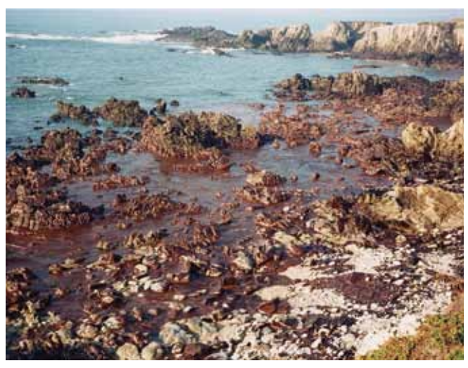
Figure 4: Emulsified heavy fuel oil, highly viscous and brown in colour.