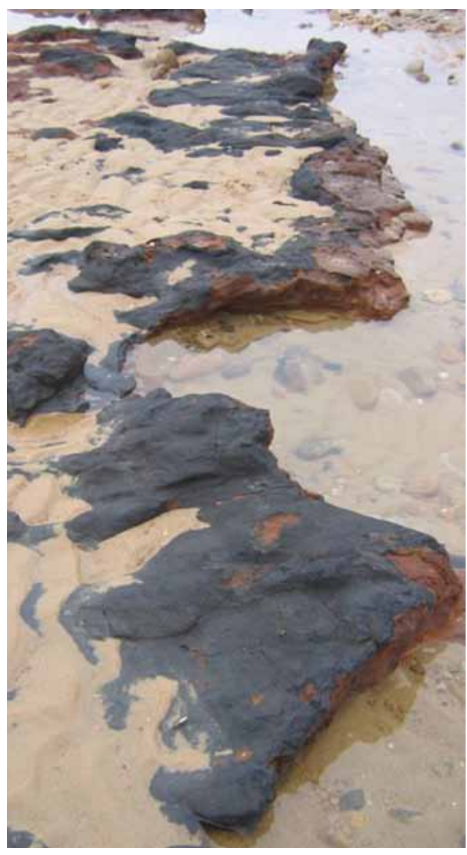
▲ Figure 22: Black rock resembling oil contamination.