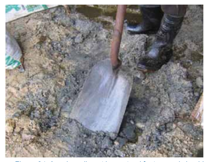
Figure 24: Anoxic sediment is a natural feature and should not be mistaken for oiling.

Where the oil is visible the problem can be addressed in two stages: