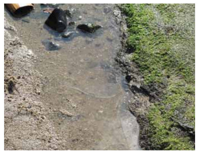
▲ Figure 7: A translucent base oil, used in the manufacture of lubricating oils, has formed lenses on the water surface. This oil was difficult to quantify due to its lack of colour.