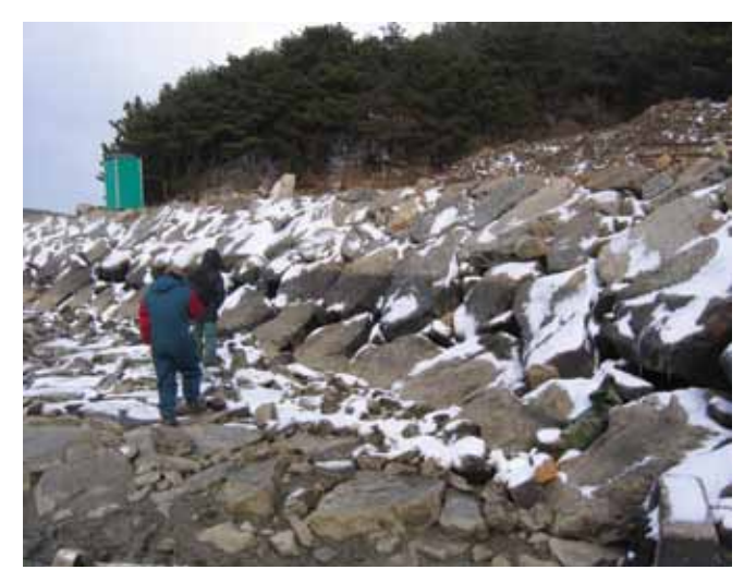
▲ Figure 25: A covering of snow may obscure the presence of oil.