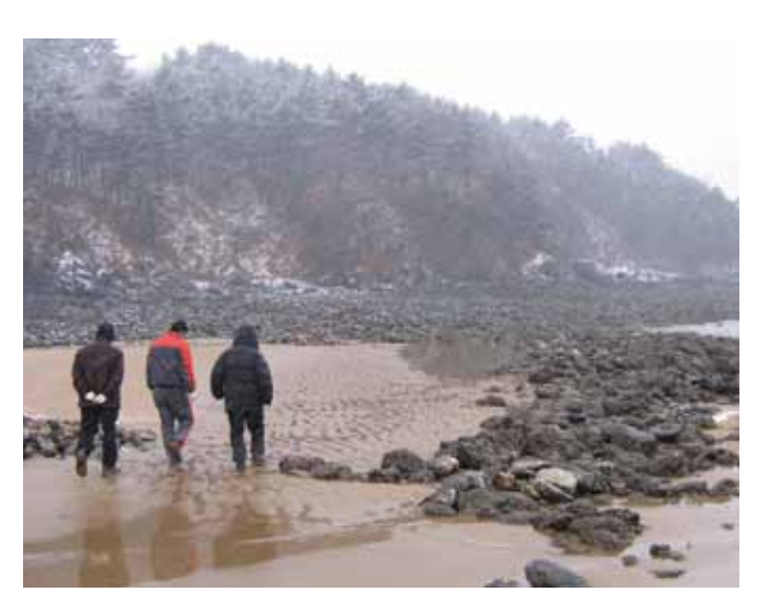
Figure 30: Walking the shoreline or 'ground-truthing' allows a more accurate quantification of the extent of contamination.