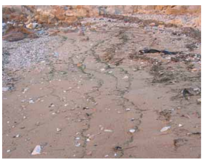
▲ Figure 18: Stranded sea vegetation resembling light oiling from a distance.