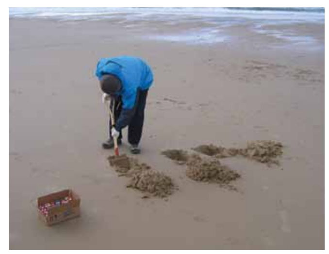
➤ Figure 34: Locating and quantifying the extent of buried oil can be a difficult task.