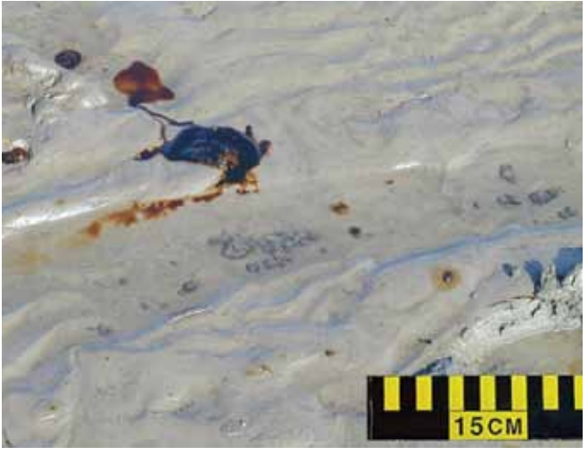
▲ Figure 10: A fresh tarball.