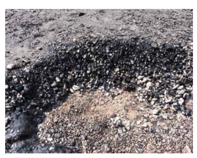
Figure 13: Heavy oiling with penetration into a shingle beach.