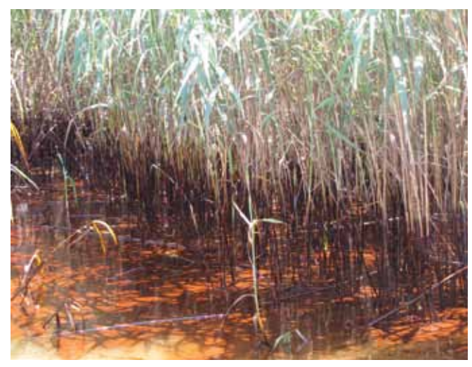
▲ Figure 2: Emulsified crude oil. The inclusion of water within the oil has caused a typical change in colour to deep orange.