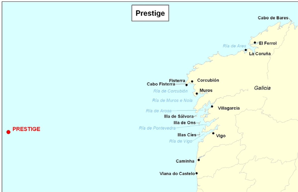
FIGURE 2. PRESTIGE sinking location off Galician coast, Spain.

the Atlantic Islands or the Galician seafood industry, including damage to market confidence.