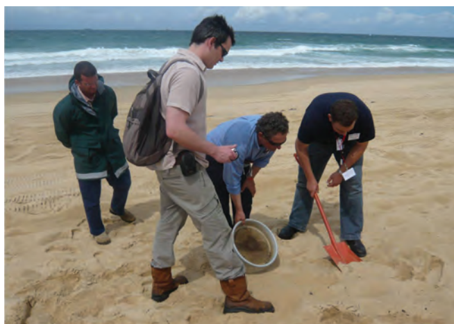
▲ Figure 2: Surveys undertaken jointly between the parties involved in a response allow agreement on appropriate clean-up techniques and the point at which clean-up operations can be terminated.

The criteria for termination of the clean-up are usually discussed jointly and agreed following inspections conducted by a team comprising representatives of the various