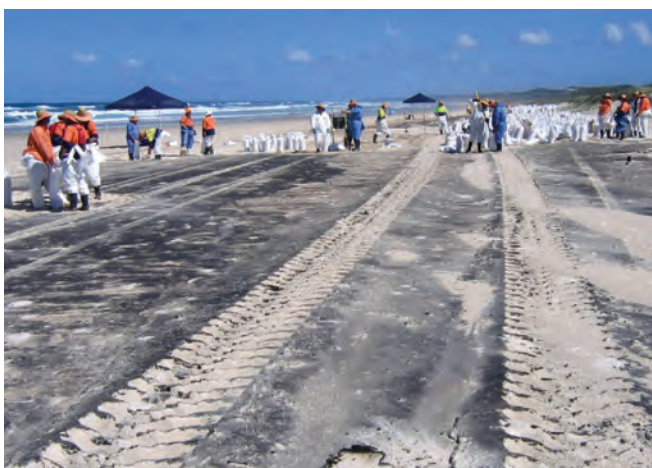
▲ Figure 6: The use of machinery on oiled shorelines can lead to additional contamination. Here, tractors have driven over an area of oil, forcing the oil into the beach.

tank trailers ( Figure 4 ). The trenches usually only survive one tidal cycle and unless fully emptied and cleaned beforehand, remaining oil may become mixed into the substrate. The location of the trenches should be carefully identified to allow re-use during subsequent low tides and to allow for final cleaning of the trenches during later stages of the response.