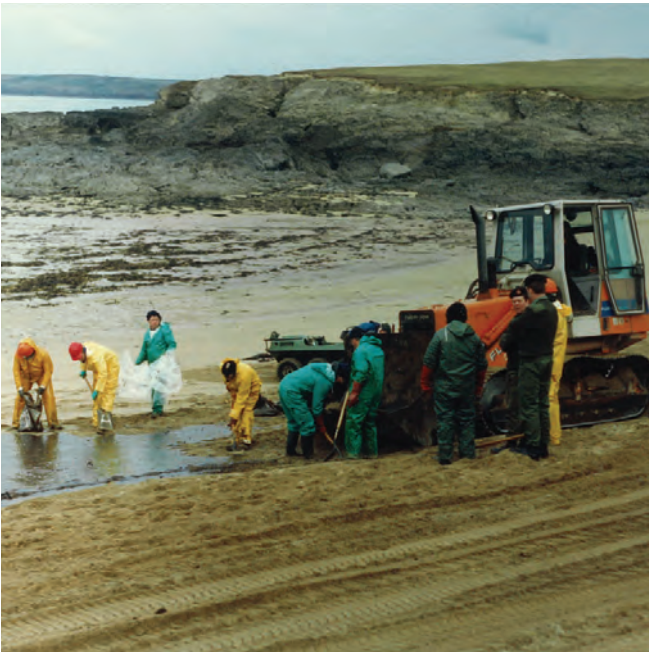
▲ Figure 44: The optimum shoreline clean-up team comprises 10 workers, allowing effective supervision and progress with the task.