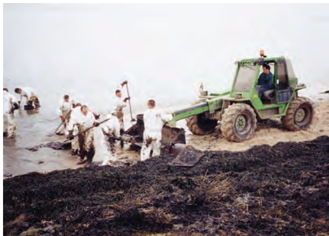
▲ Figure 8: Manual removal of oil and oiled seaweed into a telescopic bucket. This method allows oiled material to be selected in preference to clean material, minimising the amount of waste.