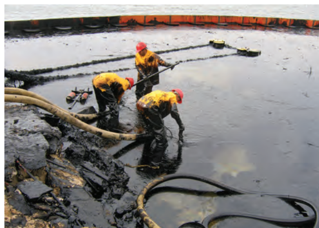
▲ Figure 3: Recovery of fluid bulk oil from the shoreline using a rope mop skimmer and vacuum pumps.

For heavy contamination of tidal sand and fine shingle beaches, the oil can be flushed or swept into trenches dug parallel to the water's edge (termed 'trenching'). Oil collected in the trench can be removed using pumps, vacuum trucks or