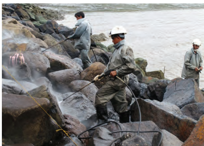
▲ Figure 32: Cleaning of rip-rap using high pressure washers.