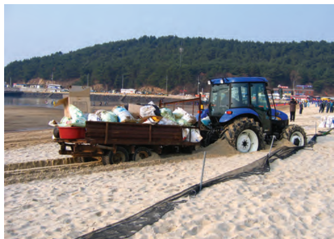
▲ Figure 39: Loaded vehicles can sink into soft substrates. This may cause additional damage and oil to become mixed with otherwise clean sediment.

If birds and other fauna are threatened, cutting and removal of oiled marsh vegetation might be considered but must be balanced against the risk of longer term damage by trampling. Cutting of mangroves is to be avoided, because recovery times are known to be protracted.