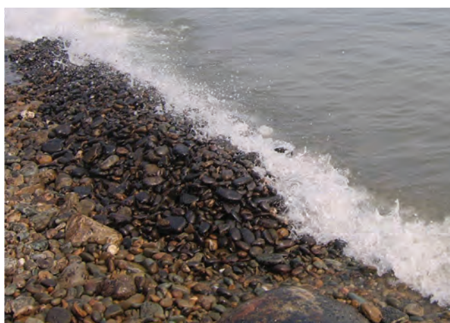
▲ Figure 20: Oiled cobbles transferred to the surf zone for washing.

‘clay-oil flocculation’ or ‘oil-mineral aggregation’. These flocculates or aggregates are close to neutrally buoyant and disperse widely into the sea.