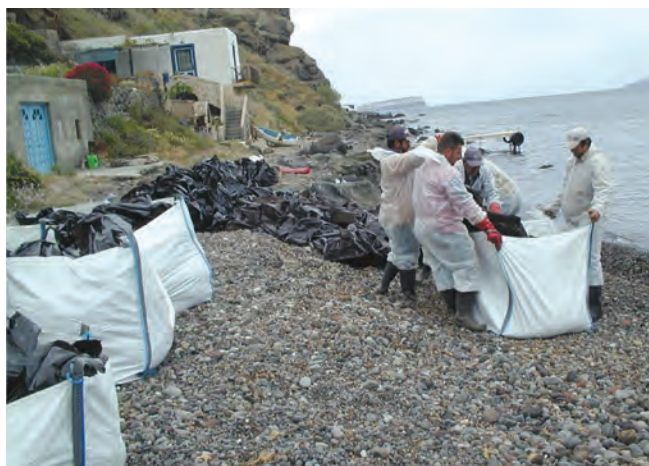
▲ Figure 10: Small bags of waste are consolidated into larger one tonne 'big-bags' for ease of transport to disposal.

generally the average oil content of mechanically collected beach material is typically 1–2% oil, whereas that collected manually is typically 5–10% oil.