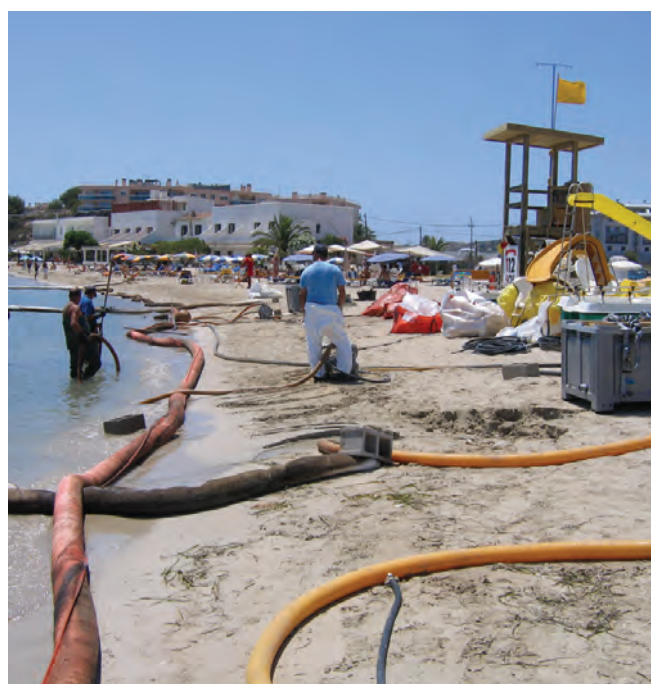
▲ Figure 37: Clean-up of sand beaches may be a priority in the tourist season.

When sufficient notice is available before the spill reaches the beach, the possibility may exist to move sand above the high water mark. This material can then be replaced after the beach has been cleaned. Flotsam and jetsam may also be removed before any oil arrives so that the amount of oiled debris for disposal is greatly reduced.