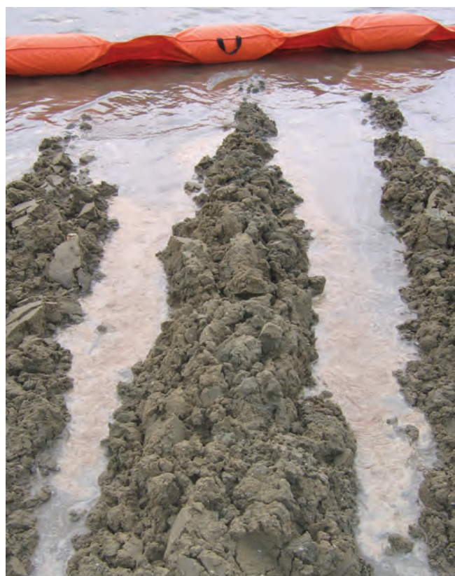
▲ Figure 25: Contaminated beach substrate is brought to the surface by ploughing. Oil is then released on the incoming tide for collection at the water's edge.