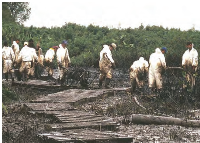
▲ Figure 40: Intrusive clean-up of an oiled marsh caused considerable additional damage over and above that of the oil itself.

The potential performance of the workforce is difficult to judge until work has commenced and has been underway for some time. For this reason, deciding how many workers are required on a shoreline is best achieved by establishing a small-scale operation on a representative section of the shoreline and then replicating this approach with the appropriate level of manpower in other areas of the shoreline, once working practices have been optimised. The number of people required will be determined by the demands of the clean-up technique employed and the amount of material that can reasonably be handled within a day. However, the performance of the workforce will also be influenced by their training, motivation and supervision, as well as the shoreline type, accessibility, weather conditions and the levels of contamination. Ideally, the workforce should be drawn from a local organisation with an existing management structure, offering established lines of authority and working relationships. While military command structures meet these criteria and might appear to lend themselves well to this type of operation, they can result in the teams being too large and some modification to the structure may be necessary. Further information may be found in the separate paper on Leadership, Command and Management of Oil Spills.