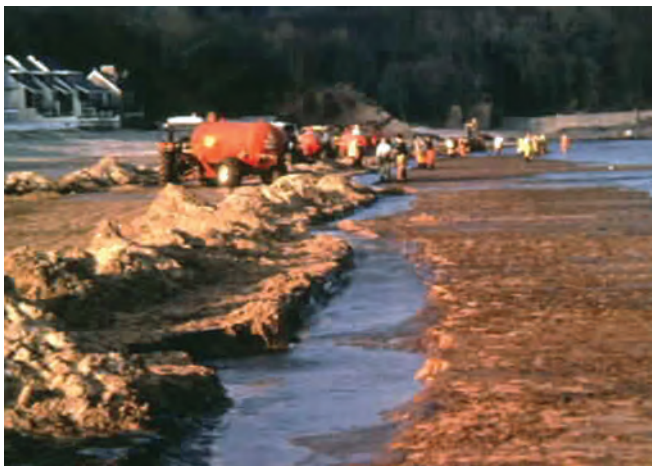
▲ Figure 4: Agricultural vacuum tankers recovering oil that has been pushed and flushed into trenches.