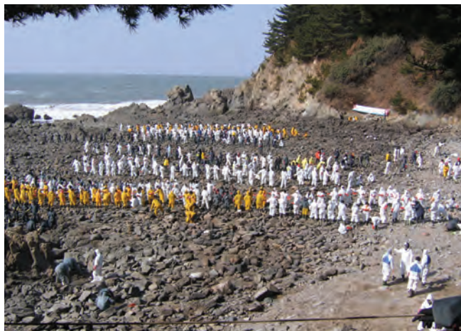
▲ Figure 14: Chains of workers handling buckets of oil and filled bags allow the rapid removal of significant amounts of waste from a shoreline.

Surf washing uses natural cleaning processes and is usually employed on exposed sand, shingle, pebble or cobble shorelines. Wave energy in the intertidal surf zone removes oil from contaminated beach material and disperses it through the water column. Surf washing is similar in principle to flushing but relies on the natural energy of the surf to provide the flushing action with much greater volumes of water than could be delivered by pumps. The resulting agitation and abrasion between the sediment particles help to release the oil from within the substrate and can break it up into droplets which are stabilised by very fine particles of sand and mud; a process known as