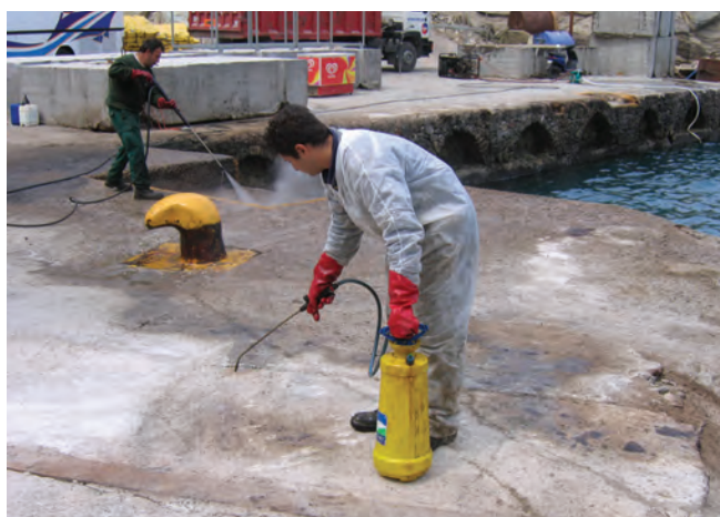
▲ Figure 23: A chemical shoreline cleaner applied to an oil stain followed by pressure washing.