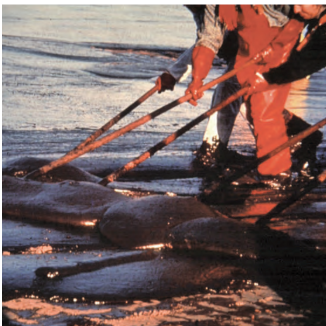
▲ Figure 12: Crude oil is scraped along a hard-packed sand beach to be collected in trenches and then recovered by vacuum trucks for onward transport to disposal.