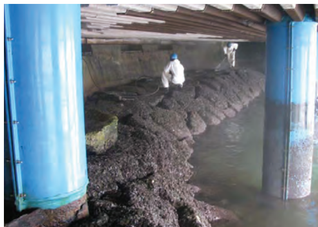
▲ Figure 31: Access underneath wharves may be difficult and dangerous for clean-up crews due to the lack of headroom and ventilation.