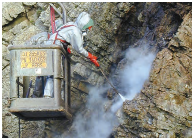
▲ Figure 21: Pressure washing a cliff face above an amenity beach. The oil was thrown high up the cliff in a storm and without cleaning would be likely to persist for some time.

In some cases, the effectiveness of high pressure cleaning