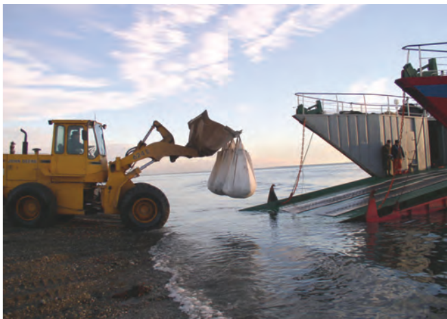
▲ Figure 11: Smaller bags of oiled waste consolidated into one tonne 'big-bags' are transported onto a landing craft for removal from an isolated shoreline.