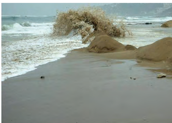
▲ Figure 19: Piled sand is washed by the incoming tide to remobilise trapped oil.