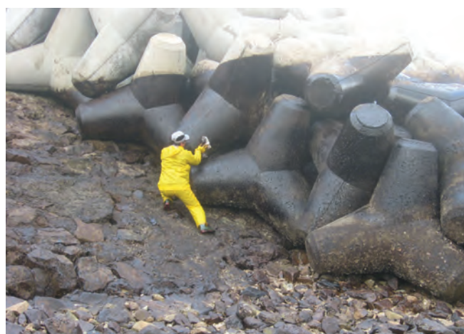
▲ Figure 33: Cleaning of oiled tetrapods is problematic, as oil within the structure is difficult to reach.