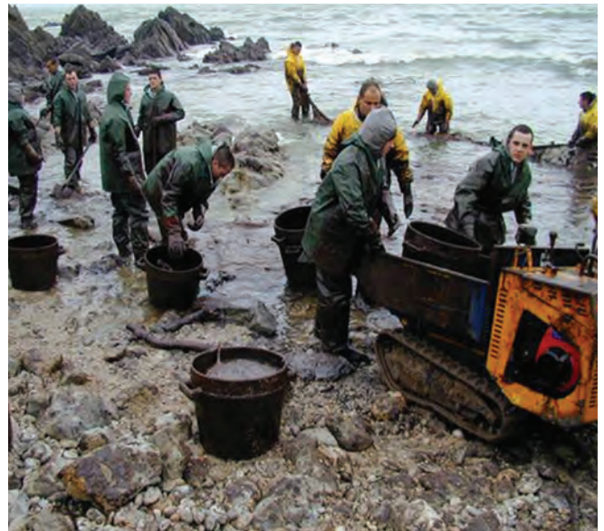
▲ Figure 1: Manual removal of bulk oil. The use of manpower for the selective recovery of oil from a shoreline minimises the amount of clean material removed.

Depending upon the situation encountered, progression through each of these stages may not be required. In some