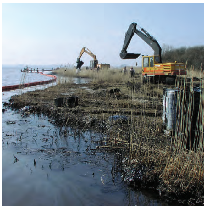
▲ Figure 41: Use of heavy machinery on sensitive areas of the shoreline may cause considerable additional damage. In this case, the need to rapidly recover free-floating oil was a priority.