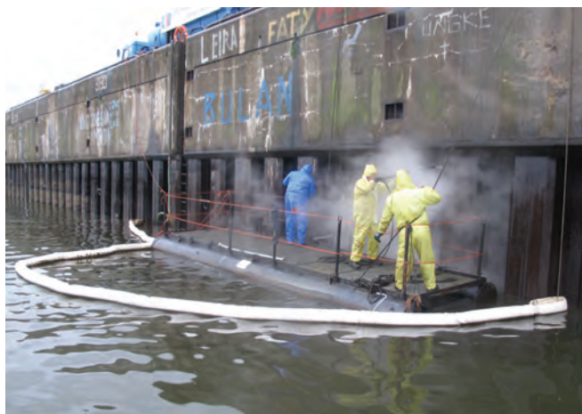
▲ Figure 30: Oiled pilings and dock quay being pressure washed from a small raft. Released oil is collected in the sorbent boom.