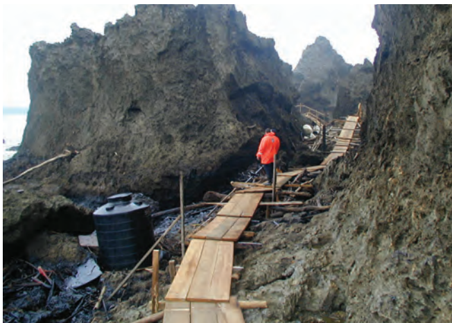
▲ Figure 35: To minimise hazards to workers on rocky shorelines, temporary walkways can be constructed.