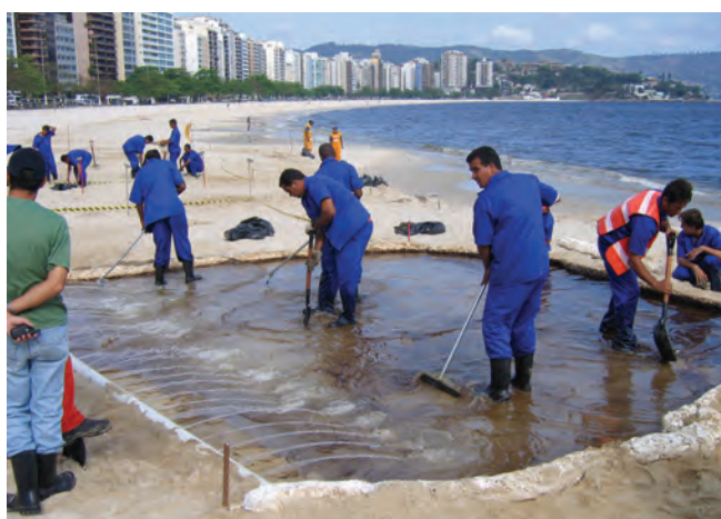
▲ Figure 16: Oil buried in a sand beach is flushed out using low pressure water supplied through lances and perforated pipes. The substrate is also agitated manually to encourage the oil to separate from the sand. The oil is then recovered by the sorbent boom surrounding the work area.