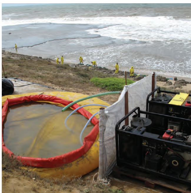
▲ Figure 22: Pressure cleaning a rock ledge in a remote location. Seawater was pumped to the temporary storage tank to be used by the adjacent high pressure machines.