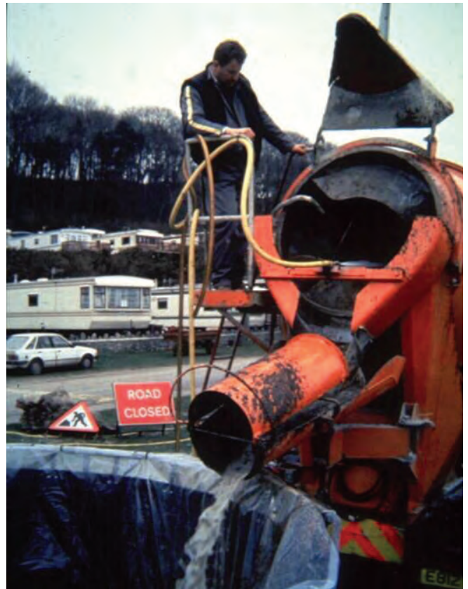
▲ Figure 24: Effluent released from a concrete mixer truck after washing pebbles and small cobbles.

Thirty to sixty minutes' flushing is usually sufficient to release most oil from a given batch. Although only lightly