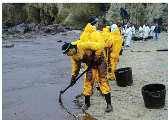
▲ Figure 38: Manual collection of emulsified fuel oil from a coarse sand beach.