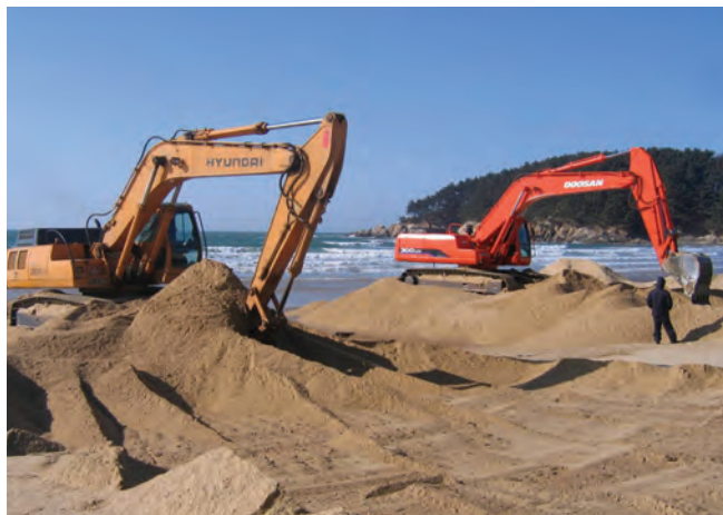
▲ Figure 18: Lightly contaminated sand is moved to the intertidal surf zone for washing on subsequent tides.