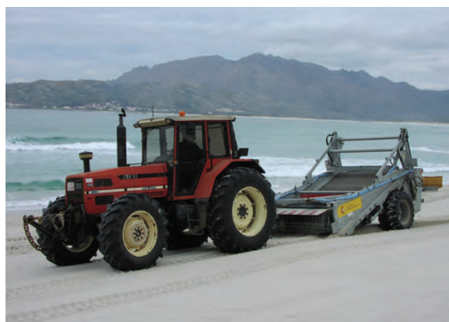
▲ Figure 26: A tractor-towed beach cleaning machine collecting tarballs.