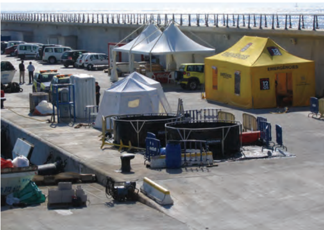
▲ Figure 45: Temporary buildings sited close to a work site provide catering and sanitary facilities for the workers.

The organisation of equipment and vehicles working on the shoreline is no less important. Segregation of the work site into clean and dirty zones, limiting the number of vehicles within the dirty zone and restricting the movement of those vehicles to within that zone, helps to minimise secondary contamination. Larger capacity trucks, for example those used to transport the collected material to storage or disposal sites, should be kept off the beach, so that dirty and clean areas remain segregated. This also helps to reduce the amount of oil spread onto road surfaces. The types of vehicles selected should be appropriate to the waste transported, to ensure loads are secure and oil cannot leak out.