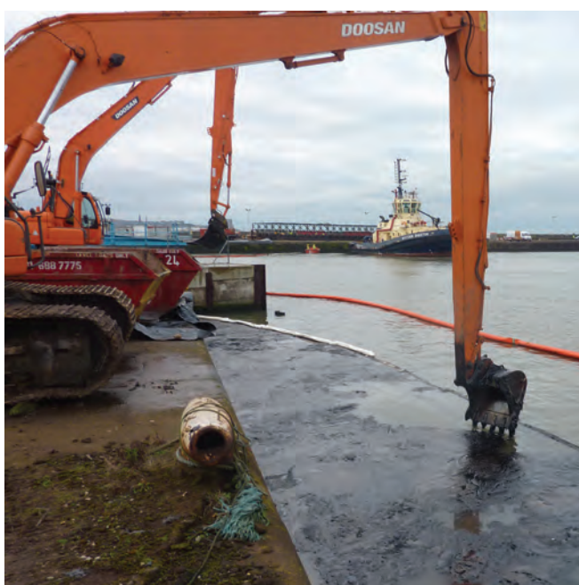
▲ Figure 5: Civil engineering machinery employed to recover oil from a port area. In this situation, the water temperature was below the pour point of the oil, causing the oil to become semi-solid, precluding the use of skimmers.