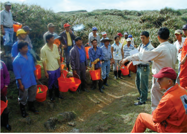
▲ Figure 43: A workforce should be clearly briefed, to ensure the objectives and the means of achieving those objectives are clearly understood.