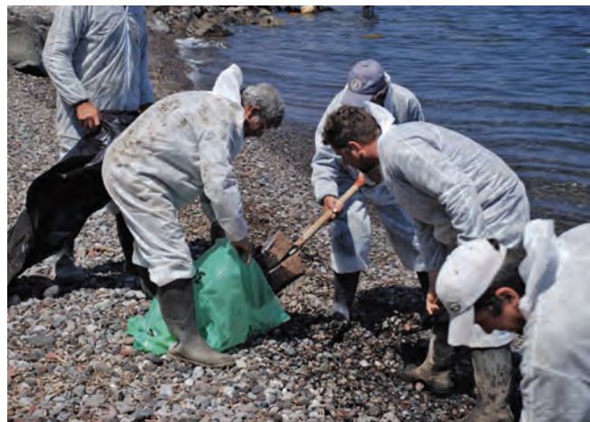
▲ Figure 36: Collection of oiled shingle into bags.