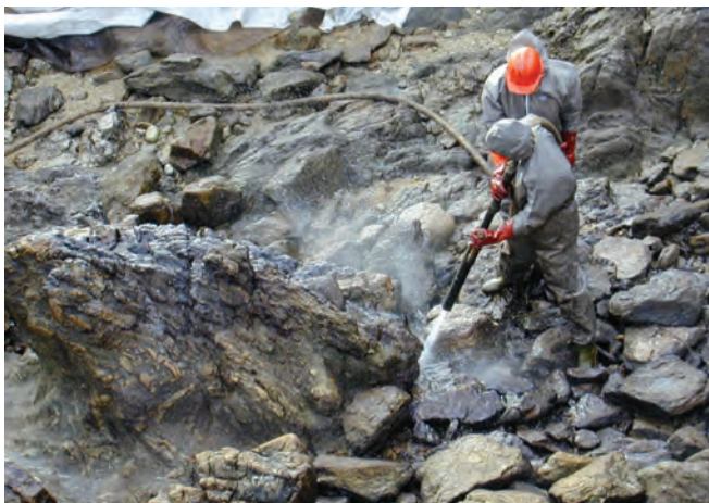
▲ Figure 17: Low-pressure water is used to flush oil from between rocks, to be collected by sorbent material further down the shoreline.