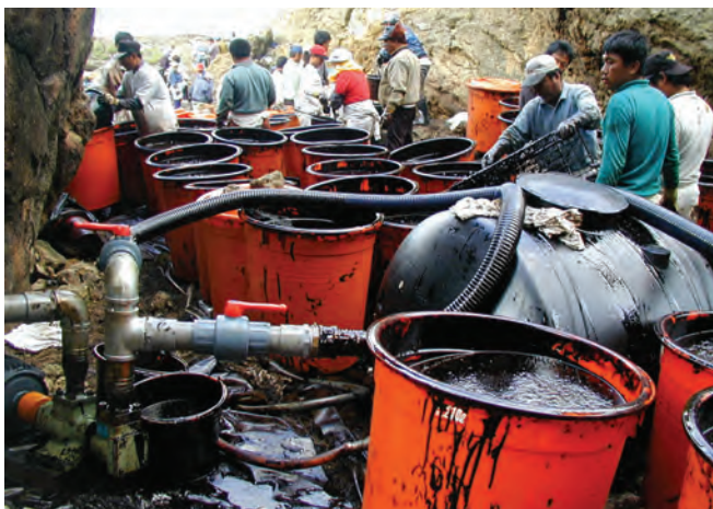
▲ Figure 13: Oil collected on a rocky shoreline temporarily stored in large open-topped bins. Pumps were required to transfer this oil to the top of the cliff and then to road tankers.

transport of sugar and rice, may be useful but can leach oil in sunlight or high temperatures.