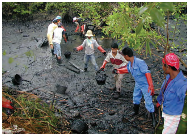
▲ Figure 42: The need to remove oil in mangroves should be carefully considered, in order to minimise additional damage to the highly sensitive structures.