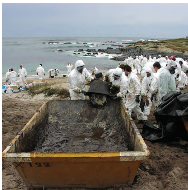
▲ Figure 15: A chain of workers emptying buckets of oil and oiled beach material into a skip used for temporary storage.