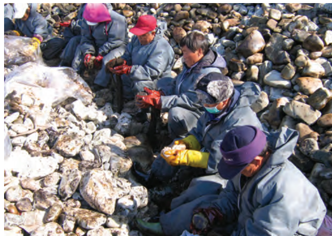
▲ Figure 28: Volunteers wiping oiled rocks with rags.