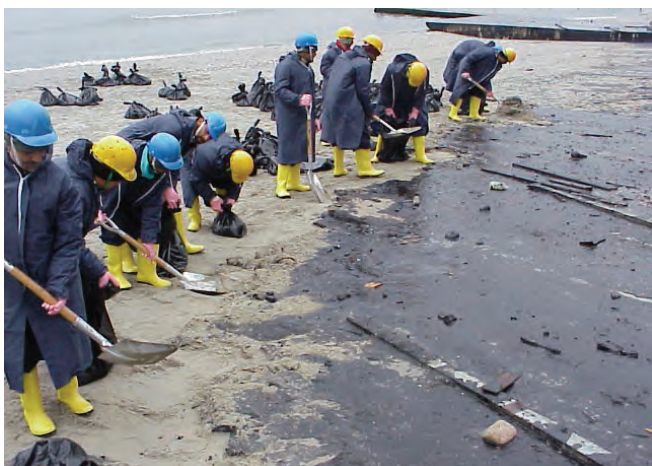
▲ Figure 9: An area of stranded fuel oil manually collected using shovels and placed into bags.