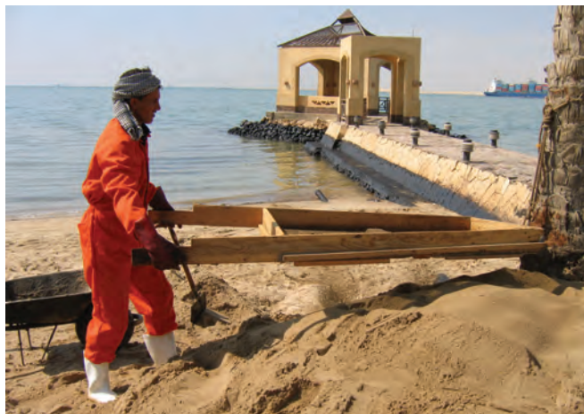
▲ Figure 27: Improvised sieve to collect tarballs.