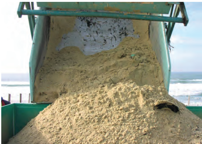
▲ Figure 7: Collection directly by heavy machinery has resulted in a high proportion of clean material and very low concentrations of oil in the waste.