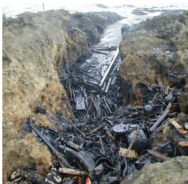
▲ Figure 34: Oil and oiled debris will collect in pools and crevices on rocky shorelines, requiring significant manual clean-up.