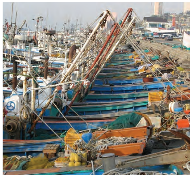
▲ Figure 1: Fishing fleets can be affected by spilled oil, either as a result of contamination of vessels and gear or by fishing bans, both of which may force them to remain in port.

The greatest impact is likely to be found near-shore, where animals and plants may be physically coated and smothered by oil or directly exposed to toxic components over extended periods of time. For this reason, sedentary species, such as