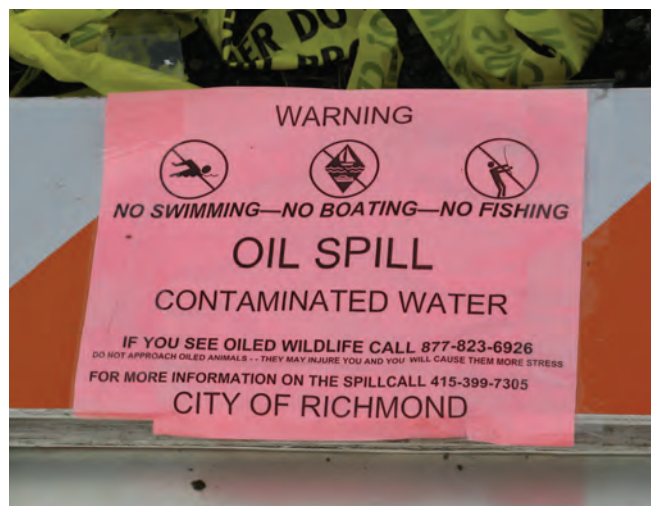
▲ Figure 15: Fishing restrictions may be imposed to protect public health and to prevent contaminated produce reaching markets after an oil spill.

For shore tanks, ponds or hatcheries, temporary suspension of water intake and re-circulation of the water already within the system may be effective to isolate stock from the threat of oil contamination. Closing sluice gates to prawn ponds, for example, can also afford short-term protection. Suspension of feeding may offer an option to avoid farmed fish and other cultivated stock coming into contact with contaminated feed if food would otherwise be distributed through a surface film of oil. The reduction or suspension of feeding has the additional advantage that the loading of waste products in the re-circulated water is reduced, but care must be taken