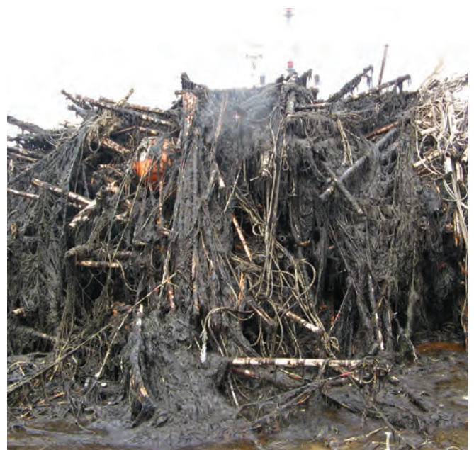
▲ Figure 12: Seaweed cultivation racks heavily contaminated with oil. These could not be cleaned to a satisfactory standard and were therefore dismantled and replaced with new structures.