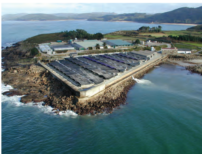
▲ Figure 7: Onshore fish hatcheries require large volumes of clean sea water. Water intakes are usually located below the water surface and may be affected by dispersed oil.

At lower concentrations, laboratory studies have demonstrated that exposure of test species to the more toxic components of oil can result in impairment of various physiological functions, such as respiration, movement and reproduction, and can increase the likelihood of genetic mutations in eggs and larvae. However, not only is it difficult to detect such sub-lethal effects in the field but the widespread impact on stocks, which might be predicted by extrapolation of the laboratory results to the field, has not been observed. Similarly, despite mortality of eggs and larvae which may occur following a spill, subsequent depletion of adult wild stocks is very rarely recorded. In part, this can be explained by the considerable natural resilience of marine ecosystems to a variety of acute impacts. Marine organisms readily adapt to naturally high mortalities, inter alia by the production of vast surpluses of eggs and larvae and recruitment from stock reservoirs outside the affected area.