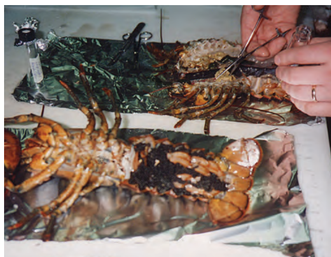
▲ Figure 17: Fish and shellfish are usually steamed prior to sensory testing. After cooking, these lobsters have been opened and the white meat will be tested for taint by smell and taste.