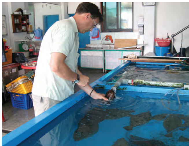
▲ Figure 18: Collection of water samples in an enclosed onshore farm. Analysis may indicate the potential for contamination of stock.