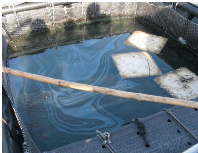
▲ Figure 14: An oiled abalone farm. Sorbent pads, though inappropriate for bulk oil removal, are often useful for removing sheen from inside fish cages.

bulk oil, they are often useful for removing thin oil films from water surfaces in tanks and cages (Figure 14). Sorbent materials have also been used successfully to filter sea water for onshore facilities. In all cases, it is important to replace oiled sorbents to avoid them becoming a source of secondary pollution. Loose particulate sorbent should not be used, as this can be mistaken for feed.