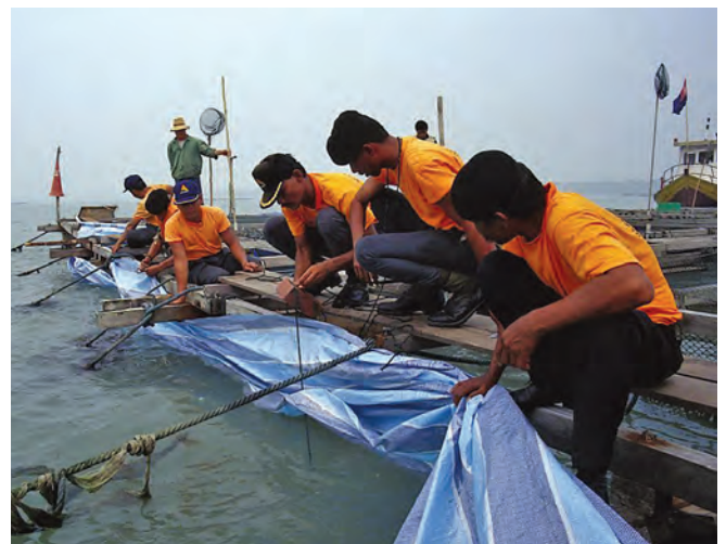
▲ Figure 13: With sufficient notice, weighted plastic sheeting can be suspended around fish cages in an attempt to prevent contamination by floating oil.