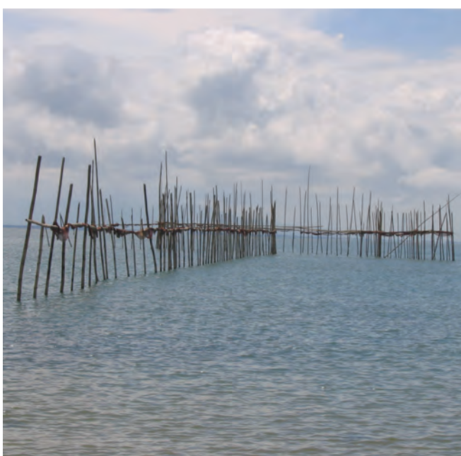
▲ Figure 6: Fish traps are susceptible to contamination by floating oil.