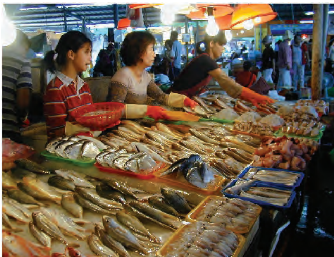
▲ Figure 10: Fish for sale – the interruption of commercial fishing activity can have important economic consequences throughout the sales chain, from landing ports to retailers, such as this market stall.

Guidance values have been established based on the sum of these 16 priority PAHs following spills. However, since PAHs form a complex mixture of thousands of compounds, 'total PAH' is often used as a measure of contamination. Total PAH is, however, often difficult to interpret, since it will depend on the nature of the particular components that have been added together to obtain the global figure. For this reason, the identities of the actual PAHs analysed should be specified to allow an evaluation of contamination levels based on a comparison of like-with-like.