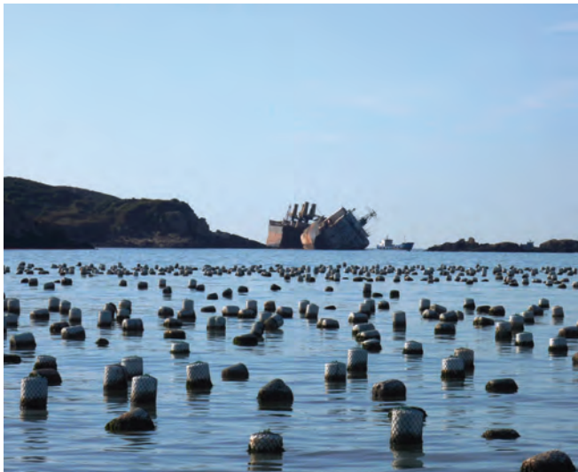
▲ Figure 2: A seaweed farm – fisheries and mariculture are often susceptible to oil spills.