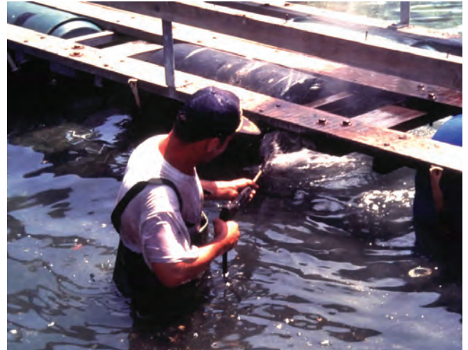
▲ Figure 11: Mariculture facilities can be cleaned in-situ by pressure washing.

Although sorbents are not appropriate for the removal of