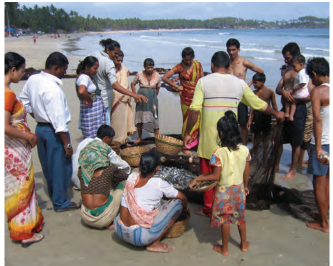
▲ Figure 3: Small coastal communities often rely on fishing for income and subsistence and can be severely affected as a result of an oil spill.

As a consequence, the sensitivity of a species or activity to spilled oil is also seasonally dependent. For example, some of the larger seaweeds grown in Asia are harvested in the spring or early summer and the next generation is not planted out until early autumn. Other faster growing species may have several plantings and harvests throughout the year. The rearing of larvae in onshore tanks supplied with water piped from the sea is similarly seasonal and does not generally extend beyond a few months in any year.