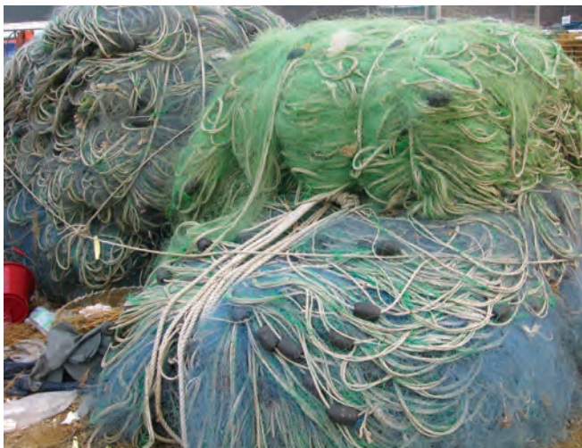
▲ Figure 5: Oiled fishing nets and pots may be cleaned, provided they are not too heavily fouled. However, in some instances, replacement may be more economically viable.