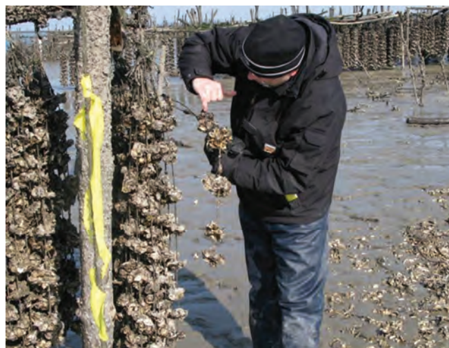
▲ Figure 19: Procedures for monitoring the levels of contamination, as with these oysters, should be included in contingency plans to avoid unnecessary fishery closures.

The taint-free threshold can be defined as the point at which a representative number of samples from the polluted area are found to be no more tainted than an equal number of samples from a nearby control area or commercial outlet outside the spill zone. This approach takes account of the fact that there may be variation between individual testers and consumers and that in any population tainted samples may occur for reasons other than an oil spill. The confidence in accepting that the fish or shellfish are clean and safe comes from an adequate time-series of monitoring data showing the progressive reduction in taint following a spill ( Figure 8 ).