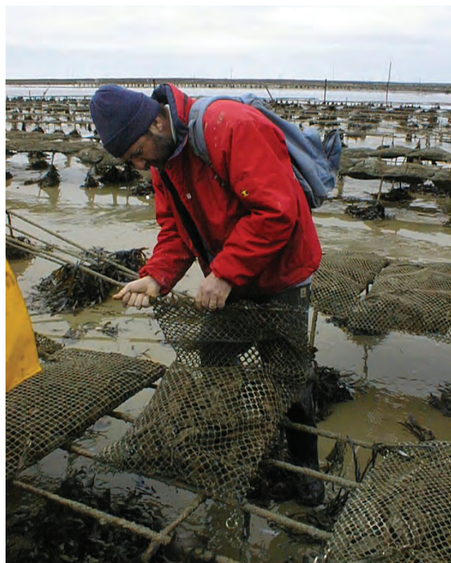
▲ Figure 16: Collecting oyster samples for analysis – the minimum number of samples to obtain reliable results needs to be determined on a case-by-case basis.

Samples of animal and plant tissue are perishable and must be collected and stored appropriately to preserve their integrity. Clean storage containers should be used (preferably glass) to avoid spoilage and cross-contamination of samples. Chilling or freezing is the most convenient conservation method for counteracting the microbial decomposition of samples in the short term. Collected samples should be sealed, labelled and quickly placed in an insulated container with a suitable refrigerant pack ready for transport to the analytical laboratory or to a freezer facility for longer term storage. It should be recognised that under some analytical protocols even frozen samples become invalid after long periods of storage.