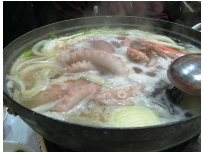
▲ Figure 9: Seafood is an important protein source for many communities.

The occurrence of contamination in seafood organisms or products following a major spill can lead to public health