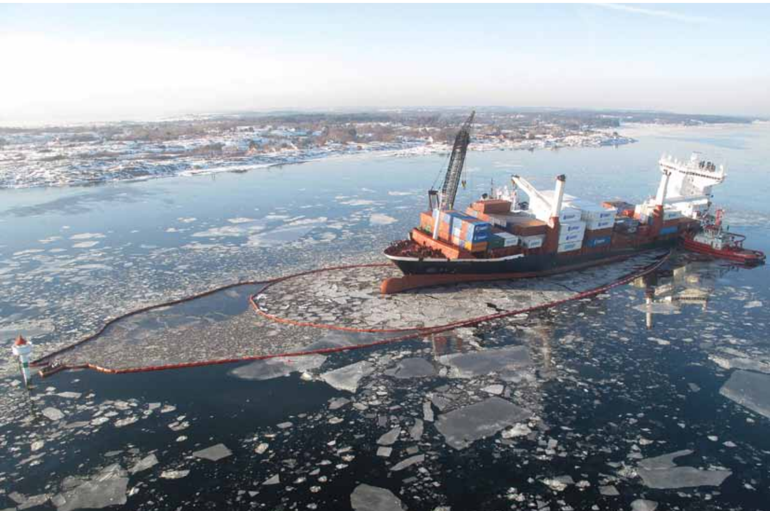
▼ Boom surrounding the casualty in the ice infested waters of the Ytre Hvaler National Marine Park, Norway

large quantities of sea ice, coupled with temperatures of around -20^{\circ}\text{C} , posed a challenge to ordinary spill response strategies and techniques. In some areas oil was either stranded under ice and snow or incorporated within the ice as it formed, causing difficulties for both detection and recovery. Different recovery methods were employed which varied in their effectiveness in the ice conditions. Booms needed to be sufficiently durable