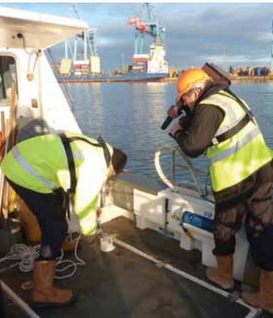
▲ Callisto film crew on site at an incident in Liverpool Docks, UK