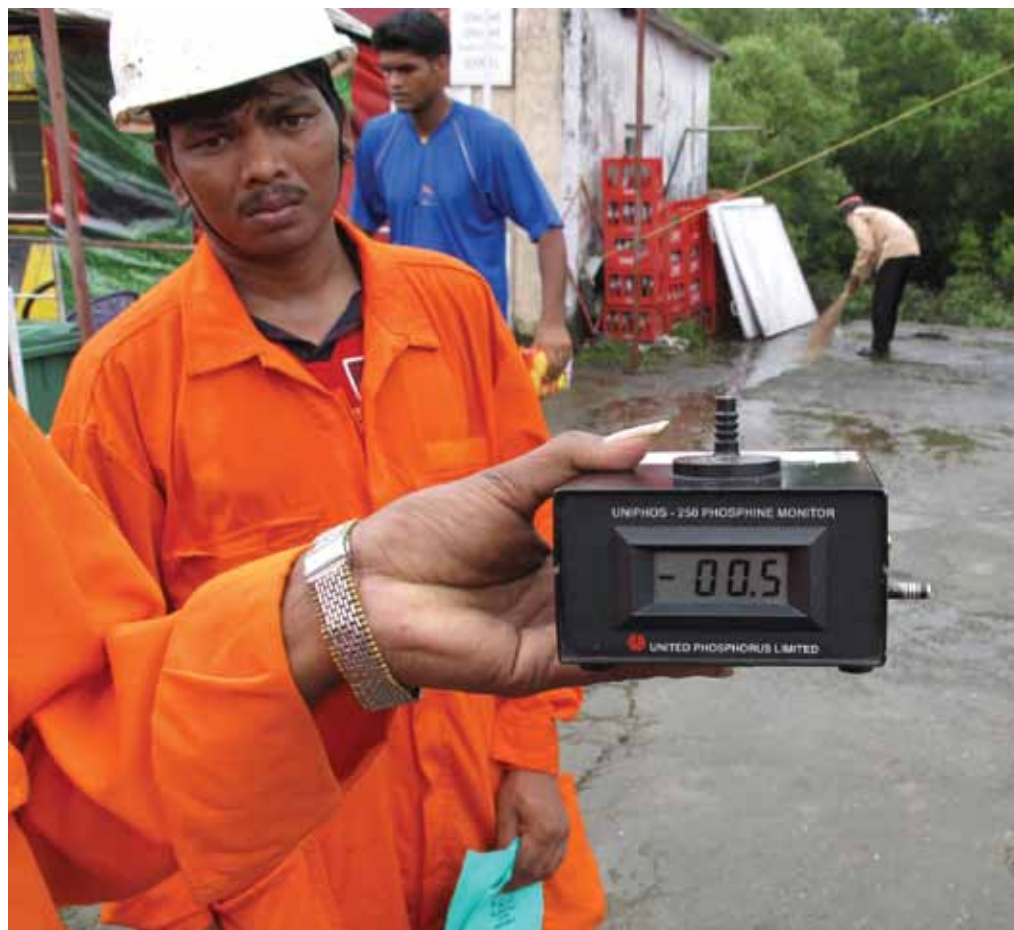
▶ Measuring levels of phosphine gas

production of leaflets and notices in various local languages providing information about the dangers of these canisters. Air modelling was also undertaken in order to establish safety zones in the event that a canister was breached. Regular surveys of the shorelines were carried out by the manufacturer of the aluminium phosphide using suitable Personnel Protective Equipment (PPE) in order to remove any suspect canisters and to dispose of them safely. Air monitoring was undertaken at all shoreline sites prior to, and during, clean-up to ensure that they were free of phosphine gas. ITOPF had regular and open communication with the Indian authorities throughout the clean-up and advised them on the strategy for protecting personnel. Clean-up operations were completed five months after the spill. After an extensive salvage operation, which involved the removal of the remaining bunkers and the majority of the containers, the vessel was refloated in March 2011. However, due to the MSC CHITRA's poor physical condition, it was decided that the most suitable option was to scuttle the ship in international waters in April.