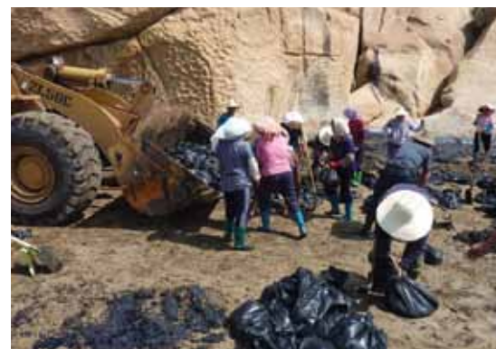
◆ Shoreline clean-up in Guangdong province, China

ITOPF's Board Meeting will be held in Beijing in November 2011 and a seminar will be scheduled for industry and government in order to discuss response and preparedness to oil pollution and to consider the new pollution regulations in China.