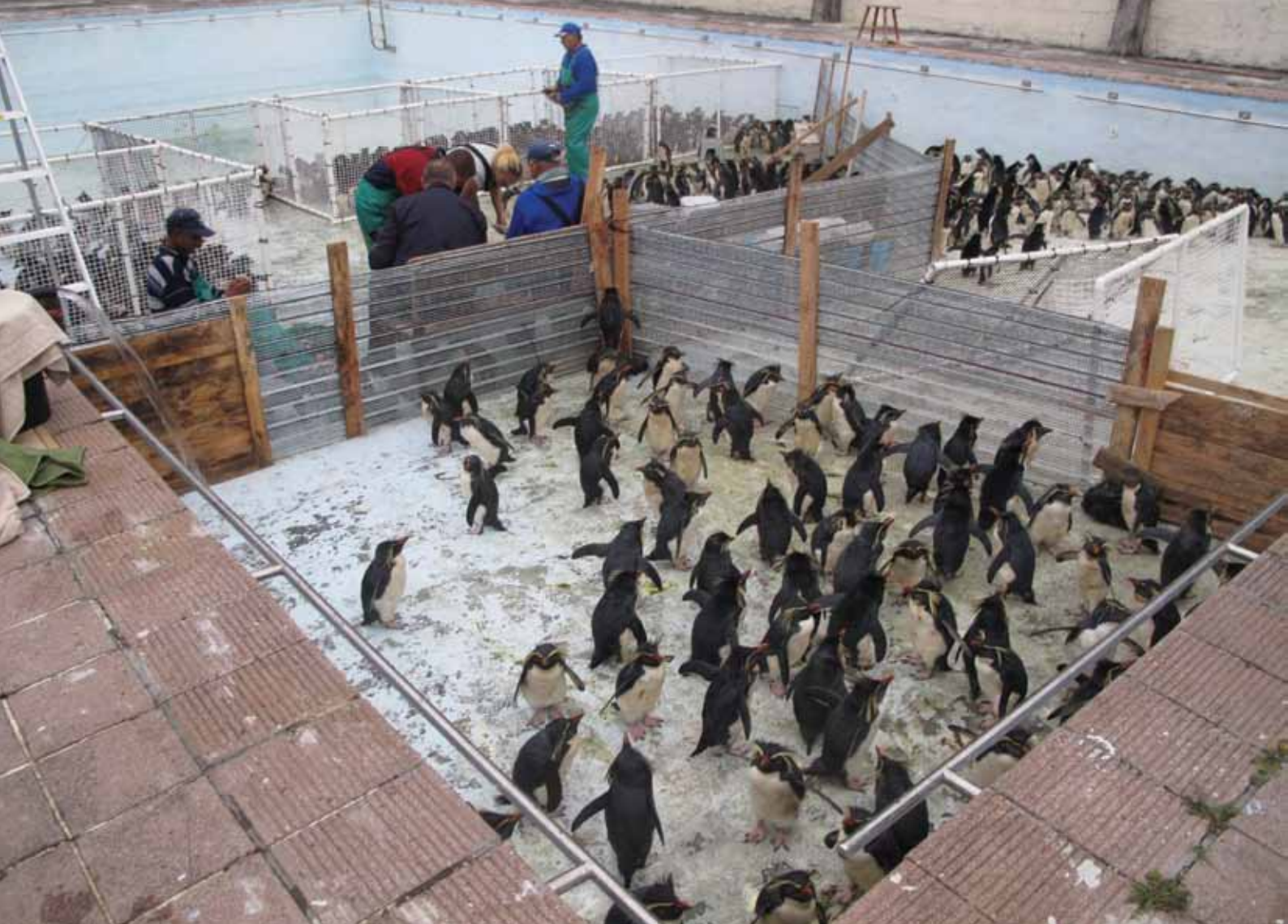
▲ The island's swimming pool was converted into a holding facility for the rehabilitation of penguins

large number of seabirds, including the endangered Northern Rockhopper penguin. Tristan da Cunha also supports a small but profitable lobster fishery, which accounts for more than 70% of the island's income and is managed by the islanders in co-operation with the sole fishery concession holder based in South Africa.