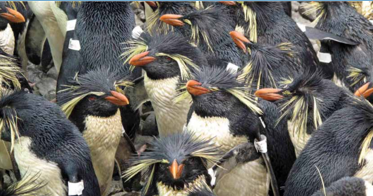
▲ Northern Rockhopper penguins tagged and awaiting release after the OLIVA spill, Tristan da Cunha

THE NEWSLETTER OF THE INTERNATIONAL TANKER OWNERS POLLUTION FEDERATION LIMITED