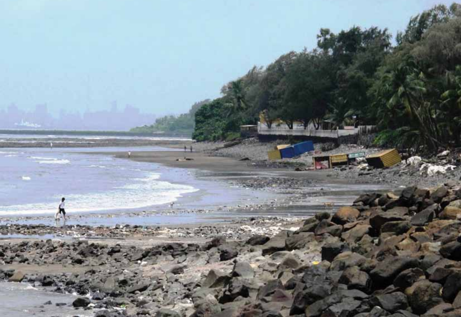
▲ Stranded containers from MSC CHITRA

production of leaflets and notices in various local languages providing information about the dangers of these canisters. Air modelling was also undertaken in order to establish safety zones in the event that a canister was breached. Regular surveys of the shorelines were carried out by the manufacturer of the aluminium phosphide using suitable Personnel Protective Equipment (PPE) in order to remove any suspect canisters and to dispose of them safely. Air monitoring was undertaken at all shoreline sites prior to, and during, clean-up to ensure that they were free of phosphine gas. ITOPF had regular and open communication with the Indian authorities throughout the clean-up and advised them on the strategy for protecting personnel. Clean-up operations were completed five months after the spill. After an extensive salvage operation, which involved the removal of the remaining bunkers and the majority of the containers, the vessel was refloated in March 2011. However, due to the MSC CHITRA's poor physical condition, it was decided that the most suitable option was to scuttle the ship in international waters in April.