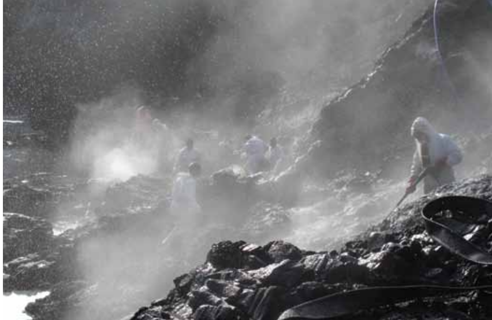
▲ High pressure hot water washing at a sheltered cove on Middle Island, Tristan da Cunha Island Group

The difficulties of locating and responding to oil spilt in ice-covered waters was highlighted by the grounding of the container ship GODAFOSS. The incident occurred in the Hvaler–Fredrikstad archipelago (Ytre Hvaler National Marine Park) in southern Norway, approximately 10 km from the Swedish border, in February 2011. At least two bunker tanks were breached and current estimates suggest approximately 120 MT of oil (IFO 380) was released into the sea. The vessel was also carrying a number of containerised