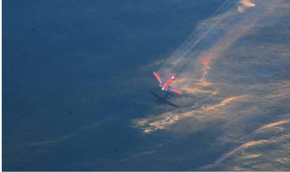
▲ Release of dispersant from a fixed wing aircraft over the DEEPWATER HORIZON oil spill, May 2010

As often occurs after a large oil spill incident, numerous R&D projects have been commissioned by government agencies, industry and other interested parties, the results of which are being monitored by ITOPF. Latterly, ITOPF has been invited to join an Advisory Committee comprised of a consortium of stakeholders in the Gulf region and to act as 'advisers/mentors' to various R&D projects being funded by BP in the aftermath of the DEEPWATER