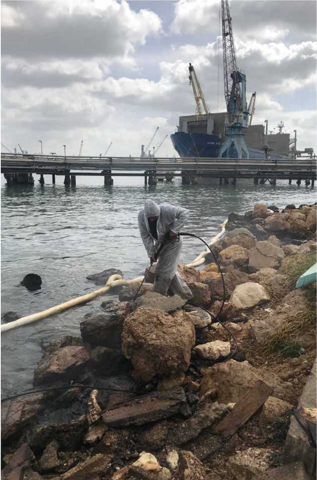
Pressure washing following a port spill in Israel