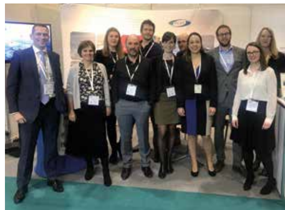
ITOPF team at INTERSPILL, London, 2018

ITOPF attended 13 new incidents up until the end of the financial reporting year on 20th February 2019, of which four involved tankers. Nine of these incidents resulted in a loss of heavy fuel oil and one resulted in a small spill of low sulphur