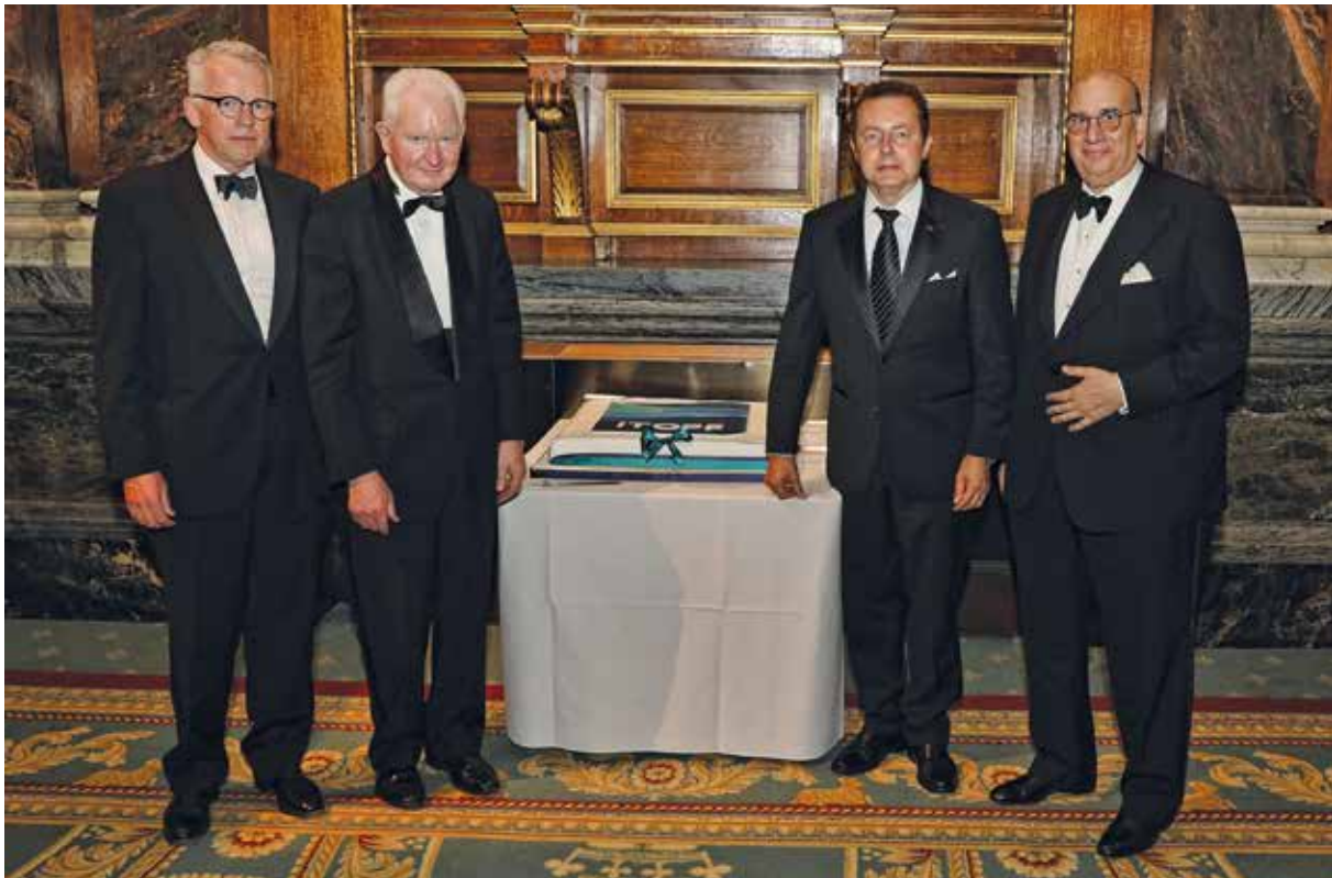
ITOPF Chairmen, past and present, at the 50th anniversary dinner

fuel oil (LSFO). Two of the remaining incidents involved a cargo of coal and base oil respectively, and one incident resulted in a spill of crude oil from a pipeline after a ship dragged anchor. The geographical spread of incidents was fairly widespread and included two in the USA, two in China and two in Indonesia. The incidents in the USA occurred sequentially, and in close proximity to each other, thus enabling the Senior Technical Adviser on site for the first incident to respond promptly to the second, which was convenient as both ships were insured by the same P&I Club.