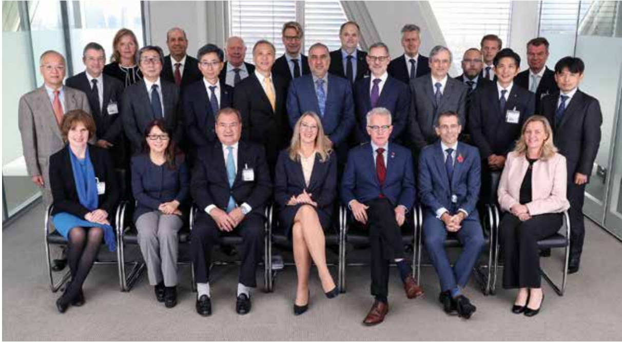
ITOPF Board of Directors, November 2018