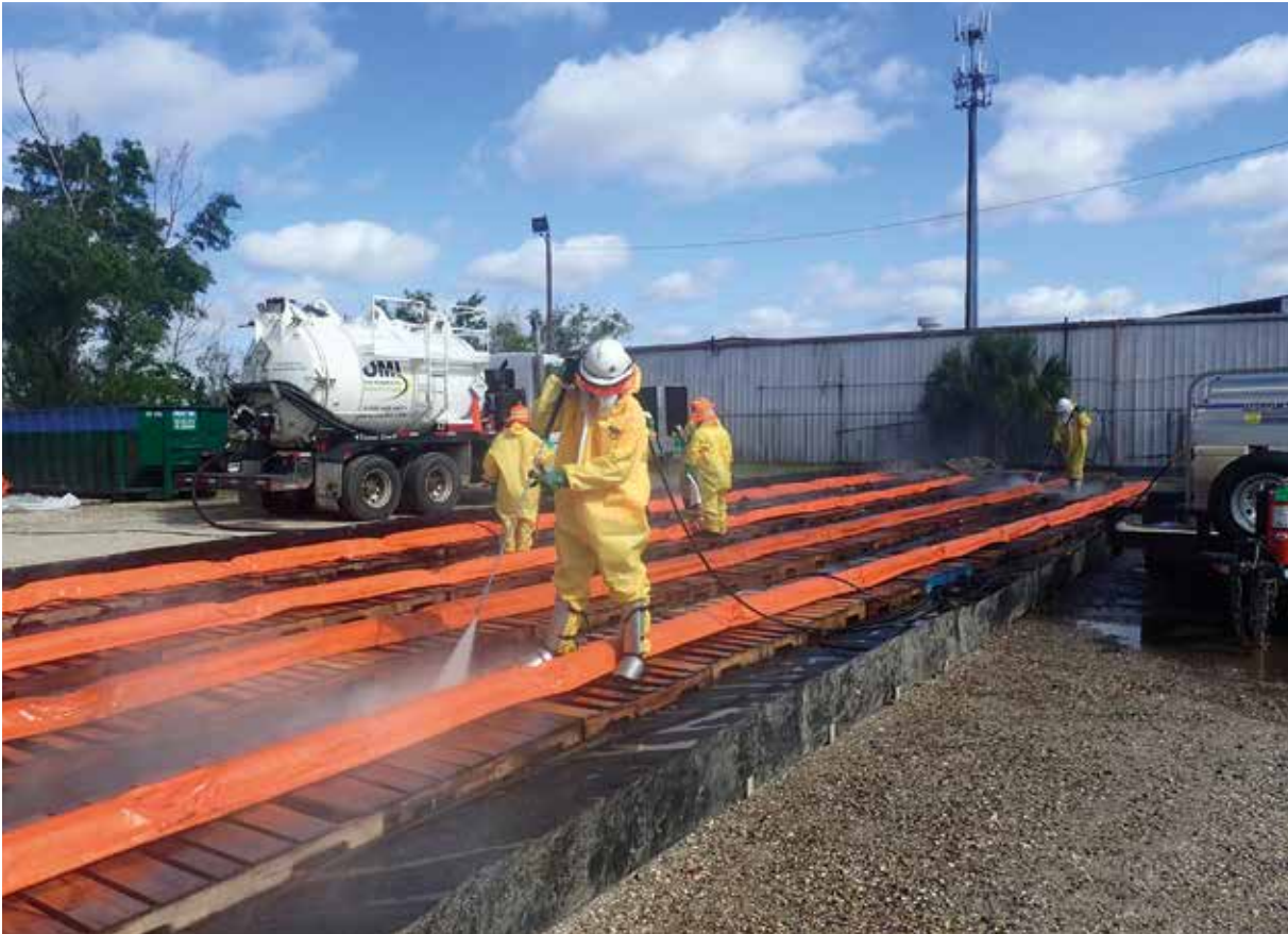
ITOPF attended two incidents less than two weeks apart along the Mississippi River, USA