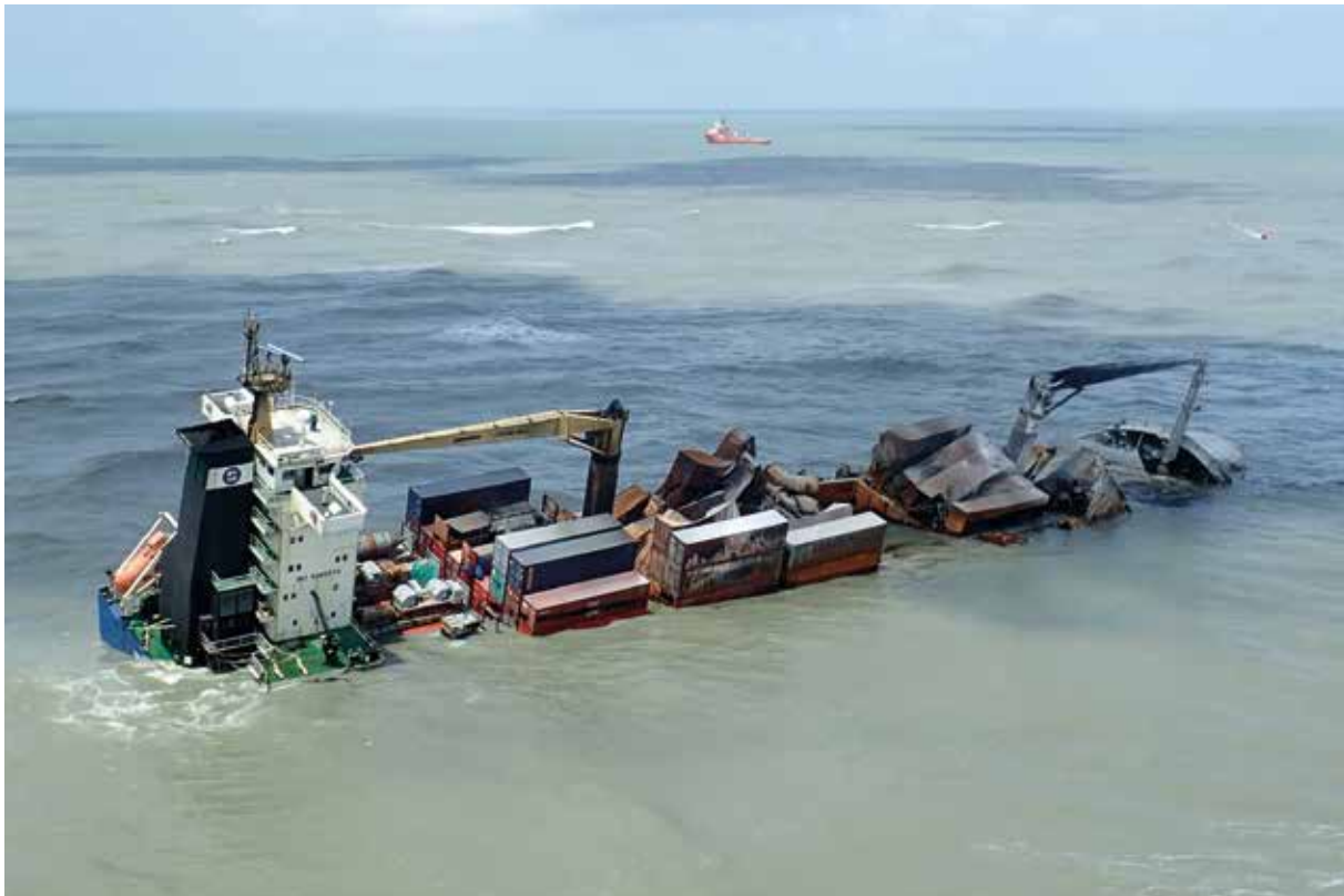
SSL KOLKATA casualty, India

to utilise RESPONSECON; a recently introduced contract providing standard terms and conditions that is offered by the International Group of P&I Clubs. A clause in this contract also provides that tariffs for resources can be agreed at a later stage and that up to 20% of the invoice may be disputed by the paying party. A contract necessitating the 'real-time' assessment of costs as they are incurred will require careful management if the balance between objective technical advice on response methods and cost recovery is to be maintained.