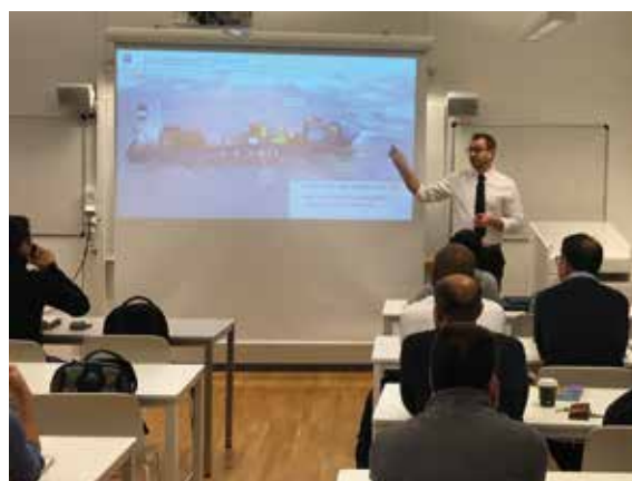
Presenting to students at the World Maritime University, February 2019