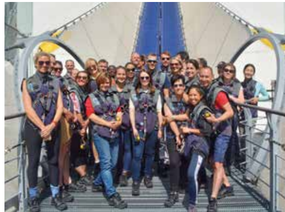
ITOPF team preparing to climb the O2 on its annual staff 'away day'