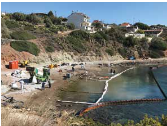
Shoreline clean-up operations in Greece following the AGIA ZONI II spill

The incident involving the chemical tanker, BOW JUBAIL, in the Port of Rotterdam was the second