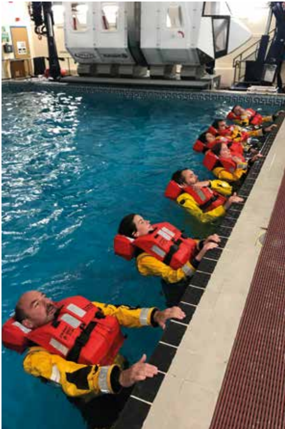
Technical staff receiving helicopter underwater escape training