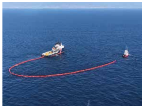
At-sea response operations following the bunker spill from CSL VIRGINIA