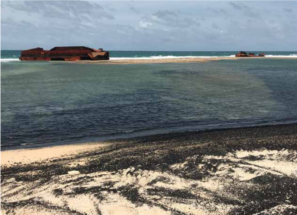
ITOPF attended one incident involving a cargo of coal during the period under review