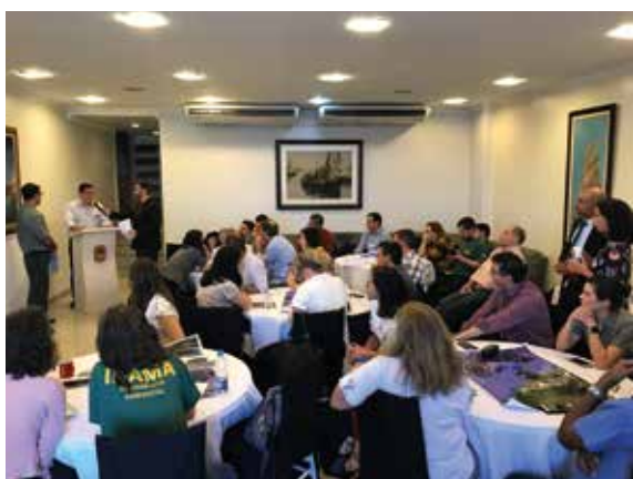
Supporting a national contingency planning workshop in Brazil, November 2018

Sharing ITOPF's experience of lessons learnt from responding to incidents at the many seminars, conferences and workshops attended remains a very effective way of reaching a large audience and promoting best practice. Staff presented at more than 30 such events worldwide during the course of the year, meeting and teaching many hundreds of attendees from a range of different backgrounds.